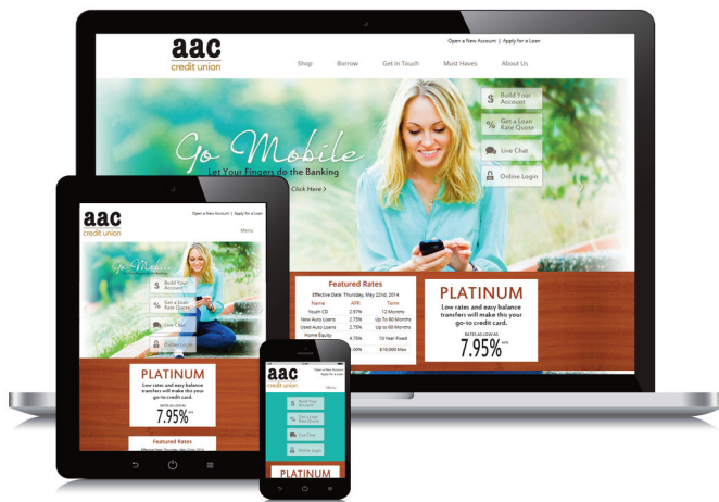
AAC Credit Union Responsive Design

Why does your credit union need responsive design for its' site? You only need to create your site once and it'll work seamlessly across thousands of screens. Responsive design improves usability and provides your members with a great user experience on every screen.